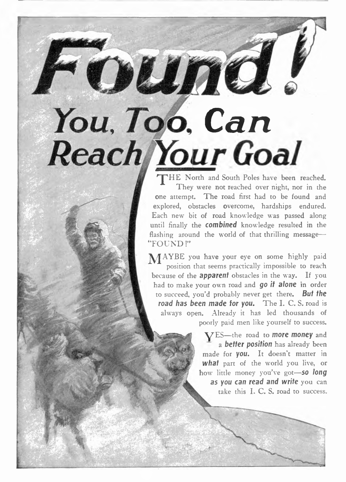
Please mention this magazine when answering advertisements.